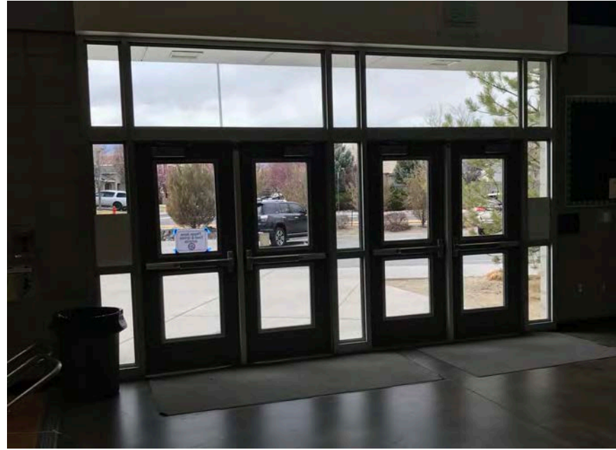
Unit Exit 6' 11" tall 5' 9" wide