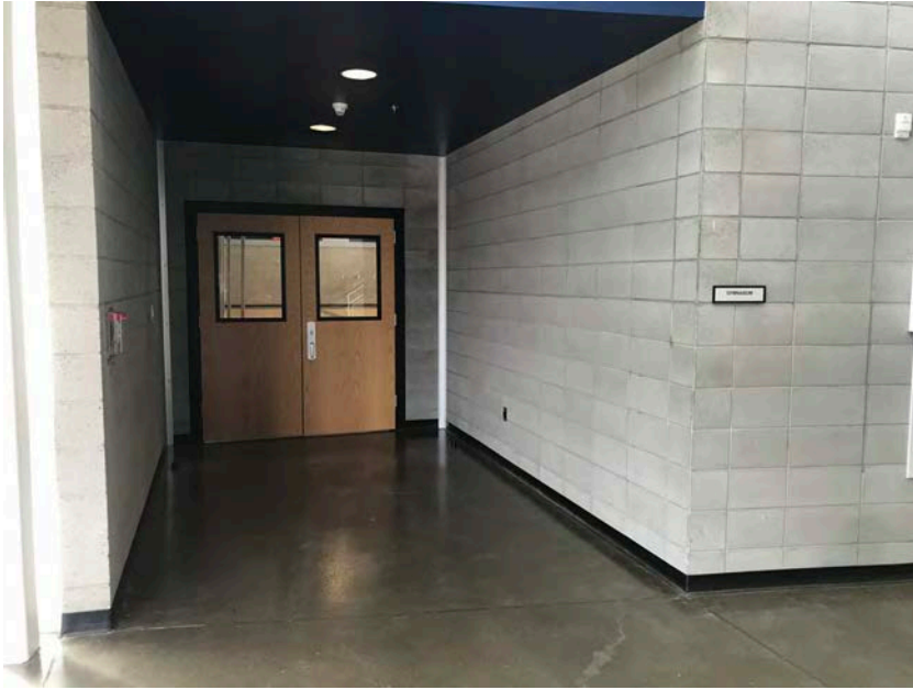
Unit Entry 6' 10" tall 5' 7" wide