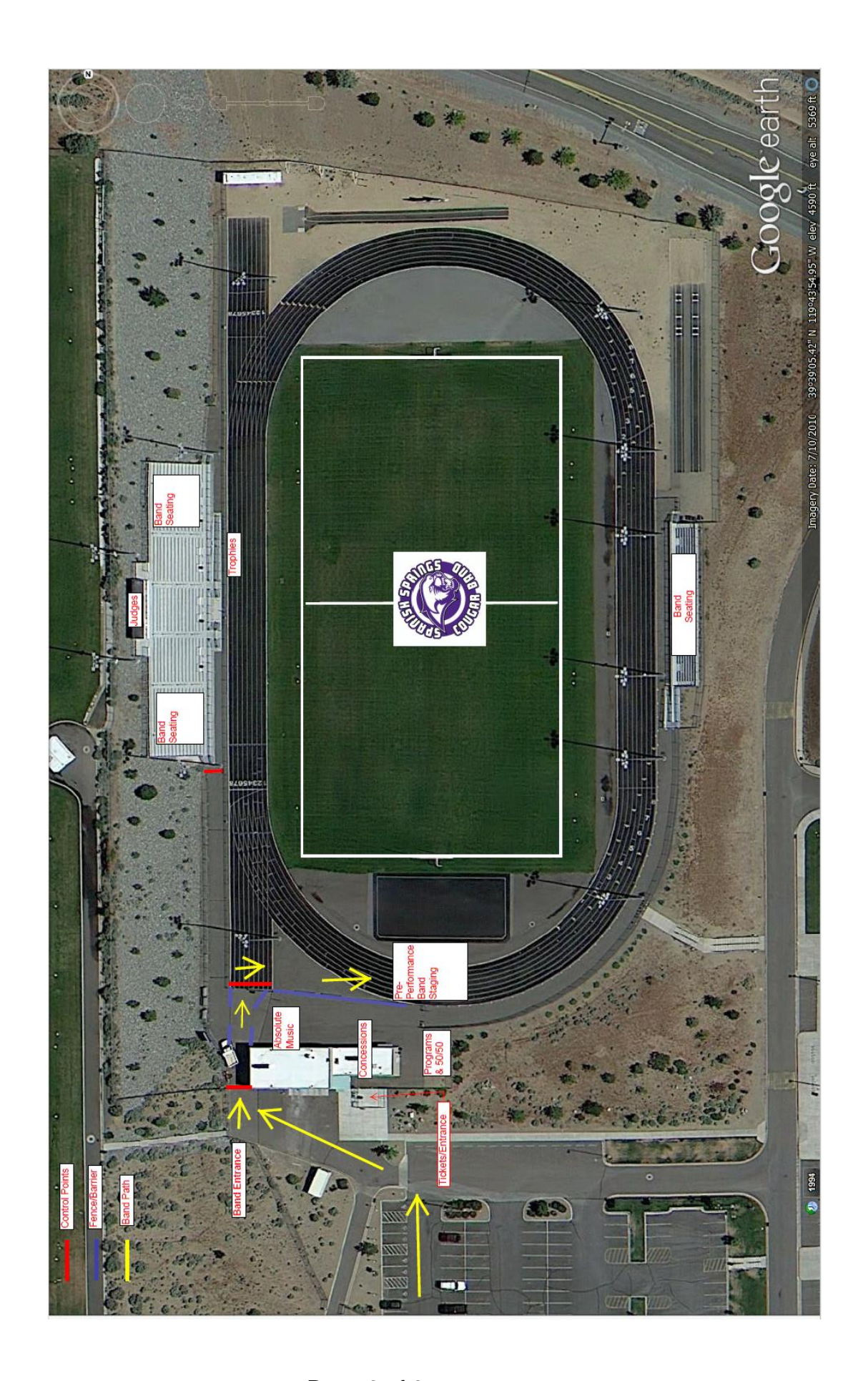
Page 6 of 6