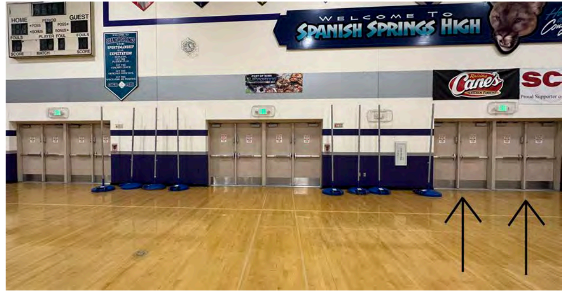
Unit Exit 7' tall 5' 10" wide

Sidewalk outside unit exit is 5' wide and leads back to the unit parking area.