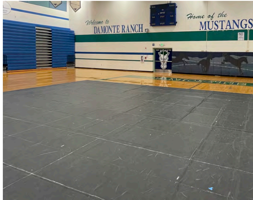
Unit Exit 7' tall 5' 11" wide