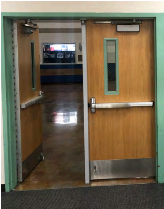
Unit Entry 7' tall 5' 11" wide